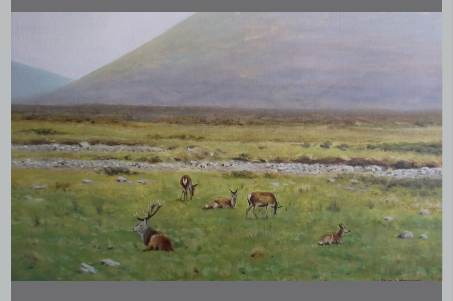
Clients include The Duke of Sutherland, The Duke of Roxburghe and The Duke of Westminster.