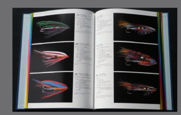
Limited edition "A Celebration of Salmon Rivers", produced by NASF