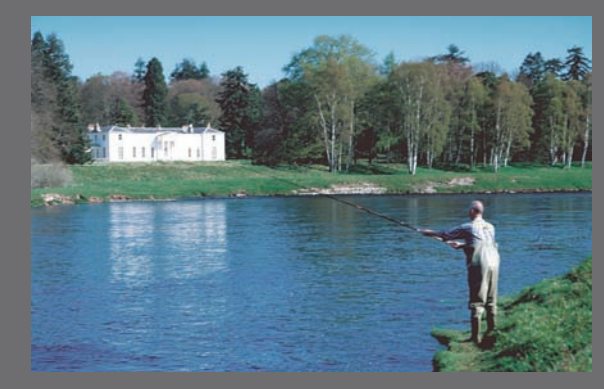
Park is a 'big fish' beat

Kindly donated by the Foster family, Park Estates, www.park-leisure.co.uk Guide Price £6,000