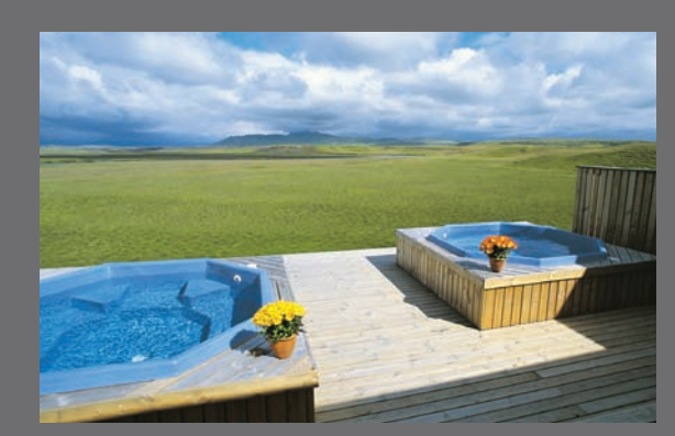
East Ranga River has been one of the most prolific salmon rivers in Iceland