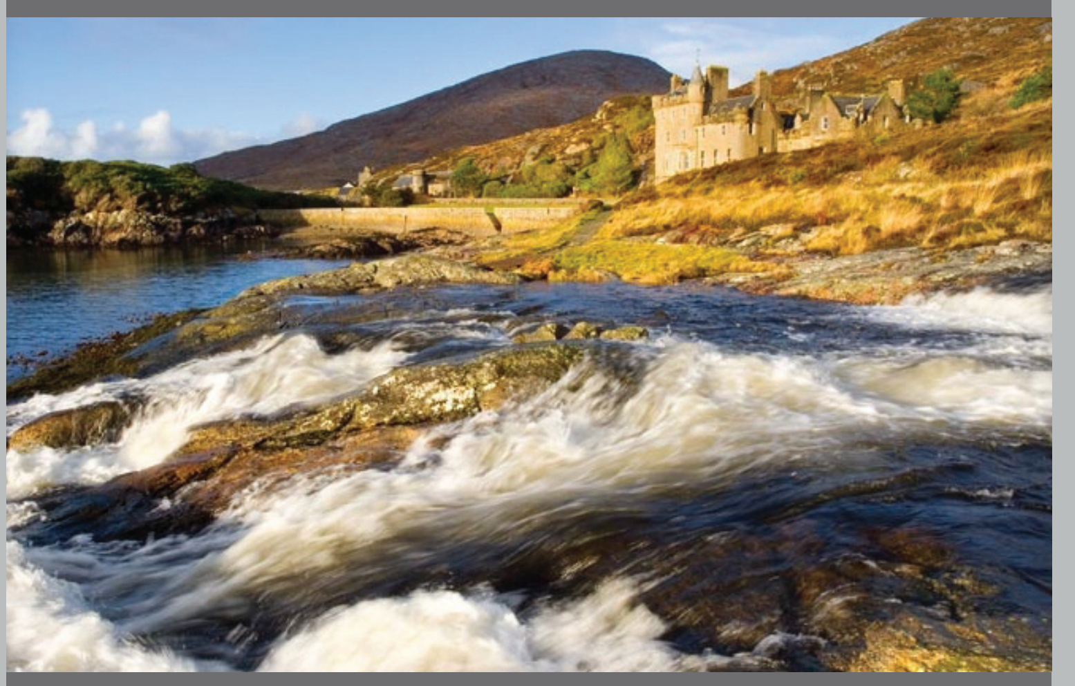
The prestigious Amhuinnsuidhe Castle, North Harris Estate

Kindly donated by Salmo Fishings, www.salmofishings.com Guide price £2,000