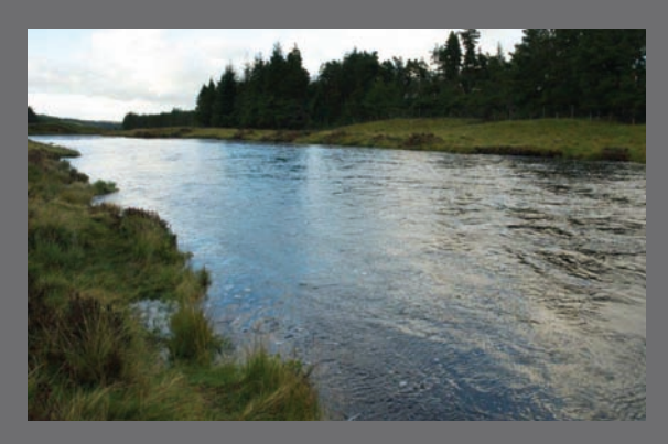
Salmon fishing on Scotland's River Naver

This sea trout fishery lands fish of up to 30 lb every year and those under 15 lb don't even make it into the lodge records!