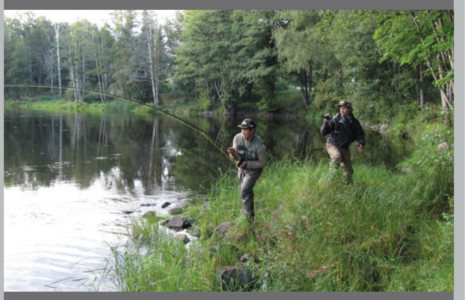
On the Mörrum in prime time sea trout season with the chance of a huge salmon too

Kindly donated by Sveasskog and Mörrums Kronolaxfiske, www.sveaskog.se Guide Price £750